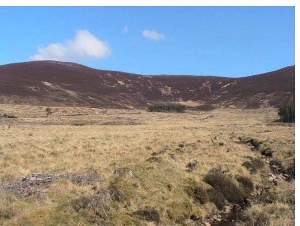
Fig. 2 : View over the proposed site from the adjacent forest track