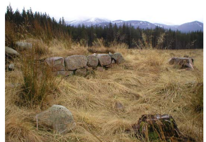
Fig. 3 : example of some of the remains of the Beglan township

identified in the course of the archaeological study, including seven boundary walls, seven houses and enclosures. Cartographic evidence indicates that the area consisted of four houses and two yards / enclosures, divided equally by a road around 1766. Three arable strips of grass were attached to the township, containing 22 acres of cornland and 21 acres of open grass. A later map (which is undated but prior to the end of the 18<sup>th</sup> century) shows Beglan consisting of 15 smaller parcels of land and the settlement consisting of eight buildings. The OS First Edition in 1875 shows that the township was deserted by that time. Its remains consisted of seven unroofed buildings, one enclosure and three dykes spread over the land.